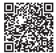
Exhibit Space & Exhibit Hall Branding exhibits@plasticsurgery.org

SCAN OR LINK TO ENVISION SITE FOR PSTM23